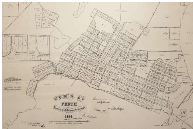
Perth 1845 Map (Alfred Hillman, assistant surveyor, acc no 347) reveals the town plan imposed upon the landscape adjacent to the Swan River in early colonial times.

The lower reaches of the Swan and Canning rivers form an estuary created by geological conditions more than 10 000 years ago. Pre-British settlement in 1829, the estuarine-river flowing in and out of the Indian Ocean at 32 degrees south latitude on the west coast of the continent that would become Australia, had long been held as a place of great importance by its Aboriginal inhabitants. Areas surrounding what is now central Perth were known as Mooro , Beeloo and Beeliar by the Nyoongar people of the south-west.