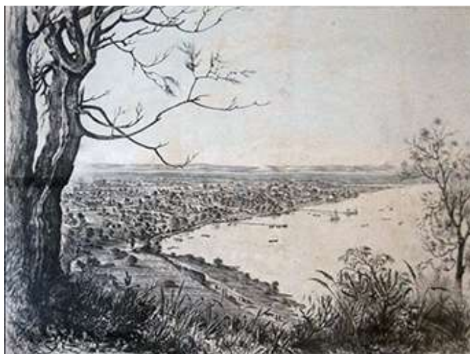
Perth Western Australia, from Mt Eliza 1852 (Horace Samson, acc no 6) illustrates that the Swan had quite a different shoreline on its north side compared to that existing today.

The choice of location for the colonial capital city of Perth reflected the advantages of both the moderate climate and favourable geographic disposition, with a neighbouring ocean port at Fremantle ( Walylup ). The establishment of the Weld Club at Perth in 1871 in close proximity to the Swan River ( Derbarl Yerrigan ) and its area now known as Perth Water ( Buneenboro ) has ensured that Club Members have always had an intrinsic connection to the Swan River.