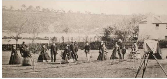
Site of The Weld Club 1860 (acc no 196). Photo shows the block that was purchased in 1889 by the Weld Club, and the folk shown here in 1860 are standing on the site of the current Clubhouse. The Kings Park escarpment is in the background, and Mounts Bay Road followed the Swan River's edge.

For the construction of the Narrows Bridge and its approaches in the 1950s and 1960s, considerable amounts of the north-west section of Perth Water were reclaimed. The former river bank in that area is equivalent to the edge of Mounts Bay Road. The whole Perth Convention and Exhibition Centre lies on the river side of the former river bank. The more recent development of Elizabeth Quay and its surrounding buildings is another notable change to the river's edge in proximity to the Weld Club. Thus our Club's relationship to and outlook onto the Swan has changed considerably over time.